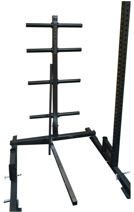
Replacement TOP CENTER FRAME

NOTE: The original TOP CENTER frame section will no longer be needed and may be discarded. The 3 bolts and washers will be reused.